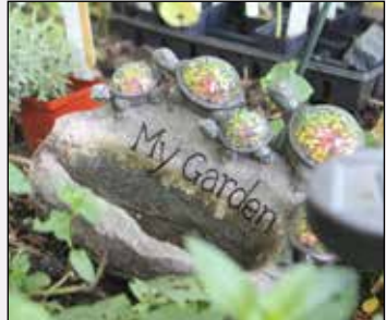
Figure 3: Ecofeminism: (a) Gaura Devi, Chipko Moment (1973) (b) Professor Wangari Maathai, Green Belt Movement (1977) (c) Community Gardeen (Harlem)

survive, you haven't done a thing. You're just talking." Wangari Maathai. In 1980's, women in Harlem united to turn vacant lots into community gardens, calling themselves the Gardening Angels.