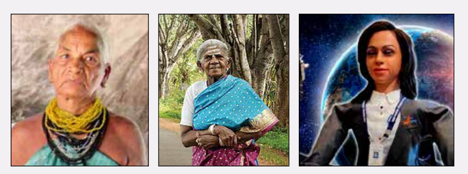
Figure 1: Portraits of Power: (a) Tulasi Gowda (b) Saalumarada Thimmakka (c) Humanoid Vyommitra (ISRO)

Portraits of Power: Woman Leading the Change (Figure 1) - Tulasi Gowda, the septuagenarian from Ankola is called an encyclopedia of forest knowledge. Having planted over 1,00,000 saplings, her extraordinary contribution towards reiuvenating conserving ang the environment has been honored with a Padma Shri in 2020. The 100-years-plus environmentalist Thimmakka from Gubbi, grew and nurtured over 8000 trees and called Saalumarada or rows of trees, was awarded the Padma Shri in 2019. Over 3,280 women propel ISRO. 20% of staff at ISRO is women, with 2,069 women