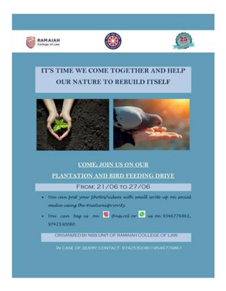
Poster of the drive

NSS unit of Ramaiah College of Law, Bangalore organised the "Plantation and Bird feeding drive" from June 21, 2021 to June 27, 2021.